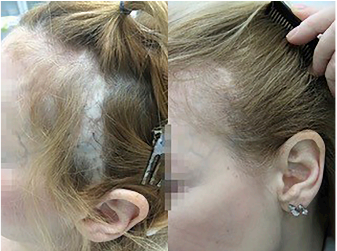
Fig. 1. A patient whose chemical injury in the temporal areas was pretreated with fat injections and then 3 months later underwent a hair transplant procedure.

Areas affected with hair loss have higher levels of dihydrotestosterone (DHT), an androgen that causes hair loss. Finasteride decreases levels of DHT but also has potential side effects. The antiandrogen effect of adipose tissue derives from the