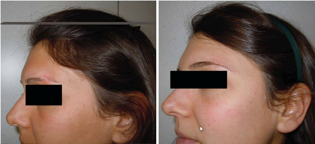
Fig. 2. A patient with alopecic eyebrow before and 3 months after adipose tissue injections. (From Dini M, Mori A. Eyebrow regrowth in patient with atrophic scarring alopecia treated with an autologous fat graft. Derm Surg 2014;40(8):926-8; with permission.)

suspension in its impact on wound healing and survival of transplanted hairs after a hair transplant procedure. At the conclusion of the hair transplant procedure, the adipose tissue recovered from the discarded donor material during graft preparation was processed using the Rigenera system (Human Brain Wave srl, Torino, Italy). This cell suspension was then injected subcutaneously and spread out over the recipient sites before and after the graft insertion. Three subjects were monitored after 5 days, 2 weeks, and 1 month. Two weeks after the procedure, healing of the microwounds was complete, and the hair continued growing, atypical after most hair transplant procedures, where the transplanted hairs typically fall out before starting to regrow 3 to 4 months later. The investigators also reported a low level of pain and edema in these patients. This study is a very small study, and more complete clinical work is necessary to better determine if and how this cell suspension improves hair transplantation results.