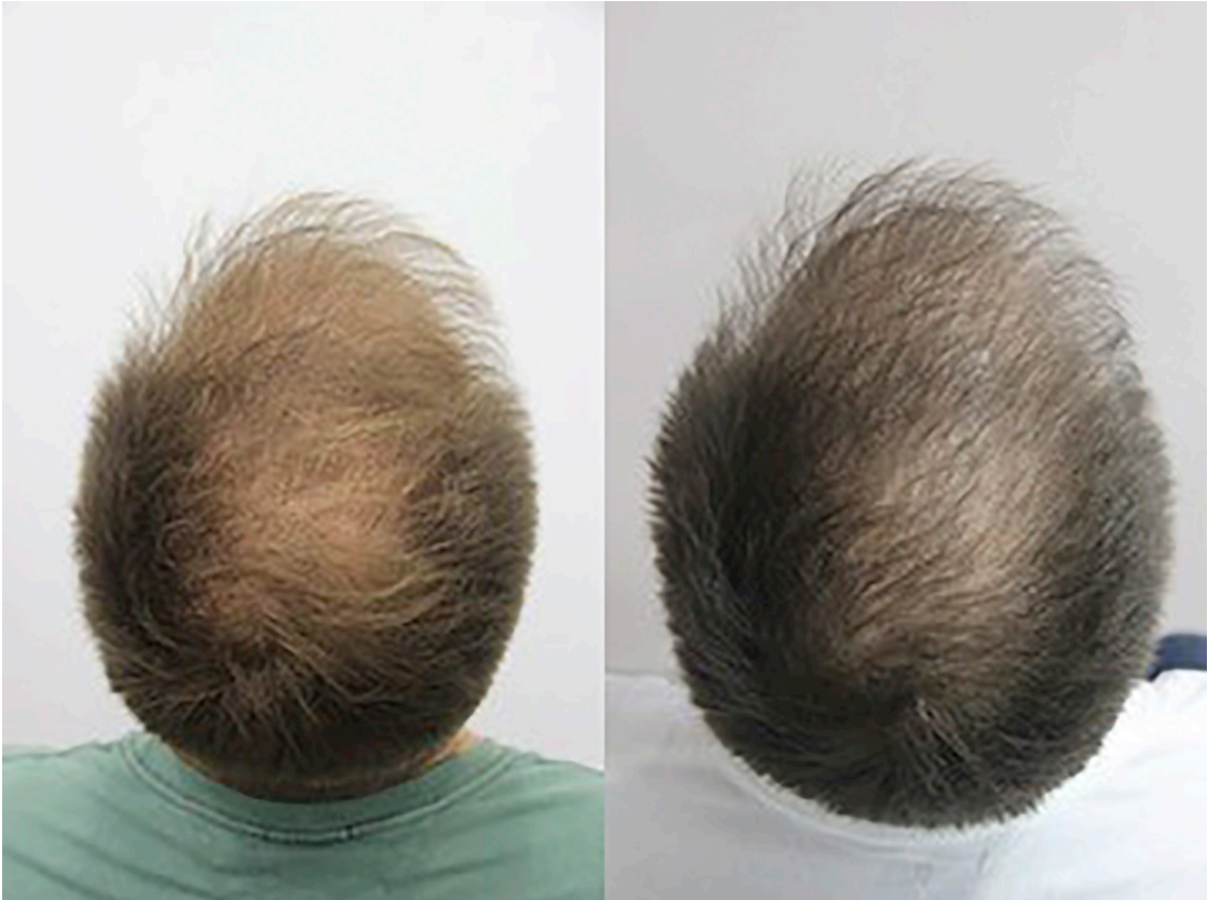
Fig. 4. A 28-year old male patient with hair loss treated by adipose tissue injections.